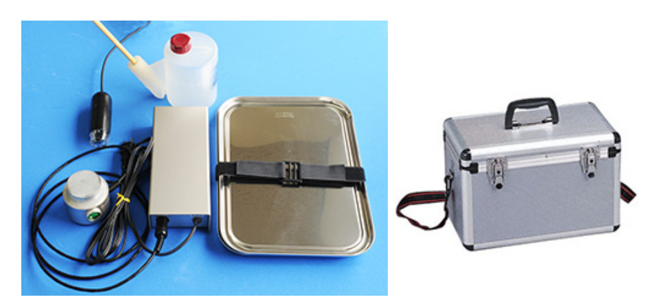
RMC1000 Metal-Mask Cleaning Kit .....Carrying case for full set.

An Ultrasonic generator, a Cleaning head, a Stainless steel pallet, a Cleaner-container (with a special pen), and the USB microscope(Except of PC & monitor)、 for an inspection are standard accessories.